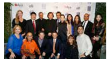
2014 Game Changers