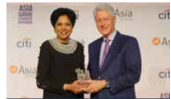
Indira Nooyi, Bill Clinton