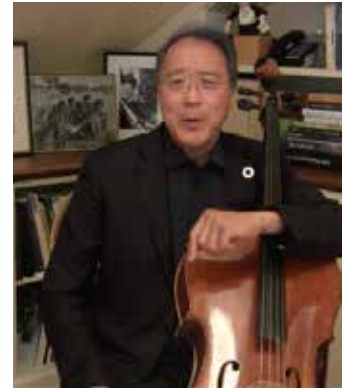
2020 Game Changer Yo-Yo Ma

In this year's 9th edition of the Asia Game Changer Awards, we are honoring heroes who are addressing some of the most urgent problems confronting this generation — the ramifications of global climate change. We will come together and celebrate the global climate and sustainability leaders who are amplifying the conversation around this urgent set of issues and exploring visionary solutions.