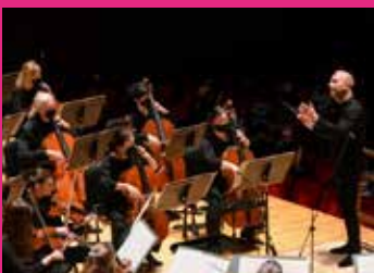
The Philadelphia Orchestra

Co-Founder and former CEO of Yahoo! Inc; Former Chairman of the Board, Asian Art Museum