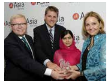
Malala Yousafzai *