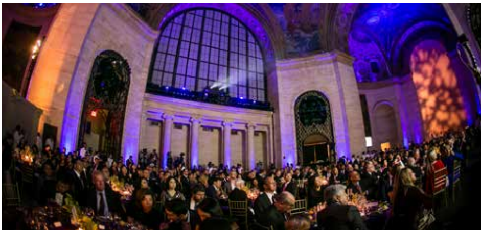
2017 Asia Game Changer Awards at Cipriani, 25 Broadway