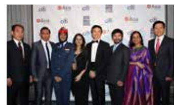
2015 Game Changers