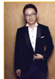
Lu Chuan Writer, Director and Producer

Lu Chuan has won critical acclaim and commercial success in television and film. In 1999, he wrote the political drama Black Hole , a 30-episode series that brought him widespread recognition. His directorial debut came in 2002 with The Missing Gun , and his second film, Kekexili: Mountain Patrol , received various awards, including the Special Jury Prize at the Tokyo International Film Festival. City of Life and Death , Lu's 2009 film about the Nanjing massacre, won the Golden Seashell at the San Sebastian International Film Festival, and Lu was selected as Best Director at the Asia-Pacific Screen Awards and Asian Film Awards. His 2015 3D fantasy adventure, Chronicles of the Ghostly Tribe , surpassed $100 million at the Chinese box office and was hailed as a "breakthrough in producing Chinese commercial genre films" due to its visual effects.