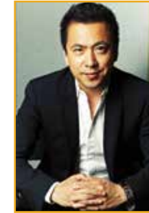
James Wang Co-Founder, Vice Chairman and Chief Executive Officer Huayi Brothers Media Corporation

James Wang (Wang Zhonglei) established Huayi Brothers Media with his brother Dennis (Wang Zhongjun) in 1994. Under his leadership, Huayi Brothers has produced over 150 blockbusters. Huayi Brothers was the first film company to be listed on a stock exchange in China, and Wang has built a leading entertainment conglomerate, investing in three major businesses: Visual entertainment (which includes films, television shows and talent agencies), Real-scene entertainment (movie communities, cultural cities and theme parks) and Internet entertainment (gaming, new media, fan communities and online distribution).